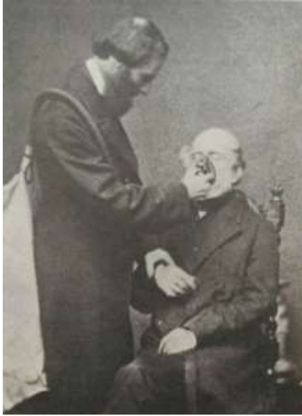
Clover's Chloroform Bag (Wylie 5 th Ed page1164)