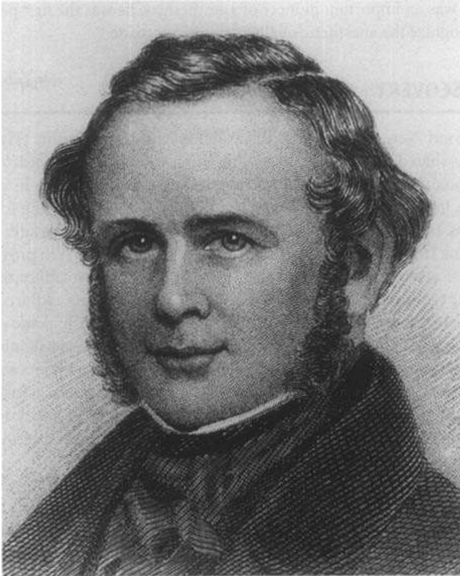
Horace Wells (Wylie 7 th Ed page3)